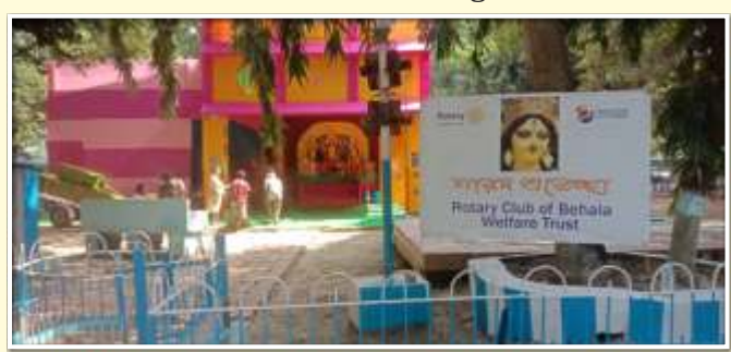
Gariahat Govt. Housing Estate

The club wished all during the festive season through banners at Puja pandals.