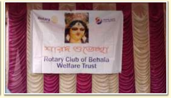
Behala Pathakpara Sarbajanin Puja